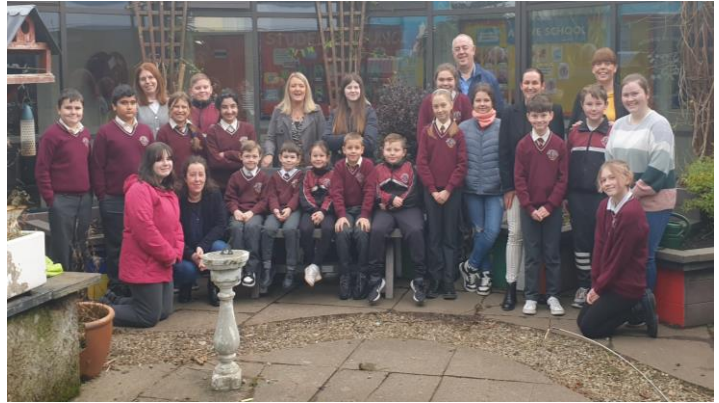
Green School Committee 2022/23

Holy Family National School has always been a school which promoted among its staff and pupils an awareness of the environment and of the necessity to make the school community conscious of its obligations to preserve our 'green community' through the reduction of waste and waste re-cycling.