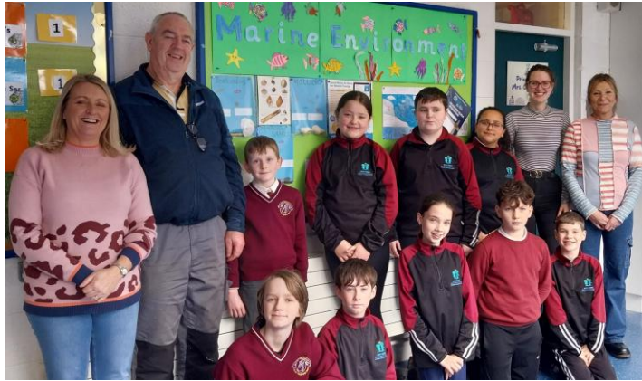
Green School Committee 2024/2025

Holy Family National School has always been a school which promoted among its staff and pupils an awareness of the environment and of the necessity to make the school community conscious of its obligations to preserve our 'green community' through the reduction of waste and waste re-cycling.